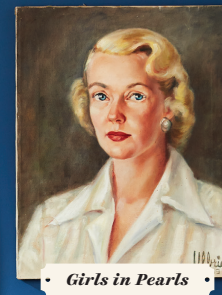
• Girls in Pearls •