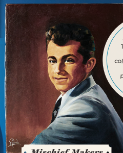
• Mischief Makers •

THANK YOU Turn to page 106 to find more of the collectors and vendors who loaned the portraits featured in this story.