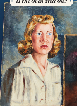
• Is the Oven Still On? •

THANK YOU Turn to page 106 to find more of the collectors and vendors who loaned the portraits featured in this story.