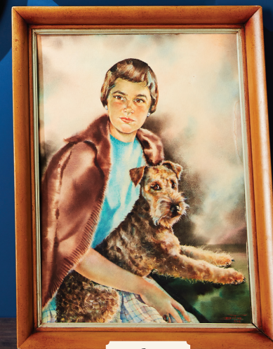
• Posh Pets •