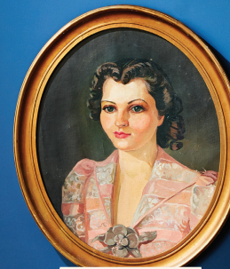
• Statement Coifs •