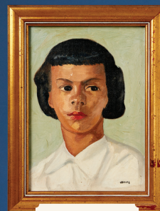
• Blunt Bangs •

Your options are endless. Want a hive of big hair? Overworked salesmen? Ladies lost in thought? Here, a few more categories to consider.