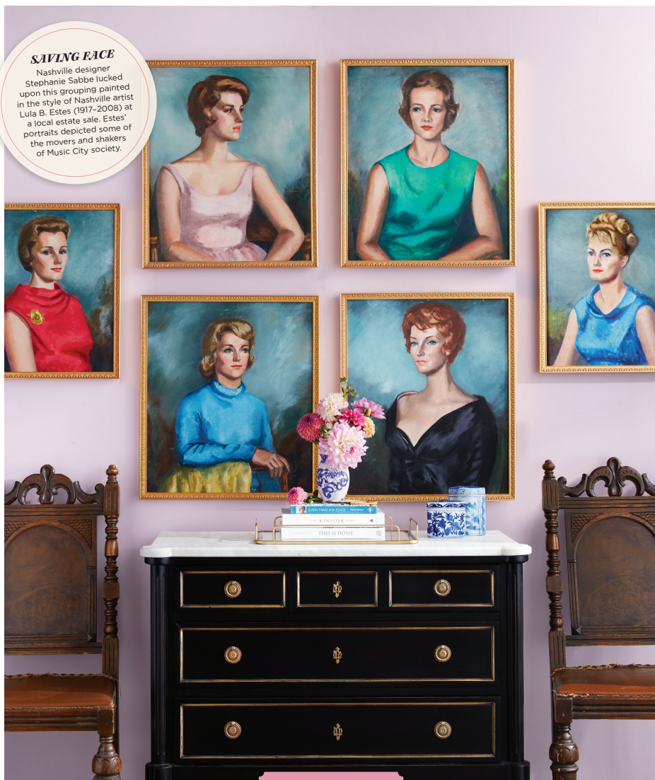
• Cotillion Club •

Nashville designer Stephanie Sabbe lucked upon this grouping painted in the style of Nashville artist Lula B. Estes (1917–2008) at a local estate sale. Estes' portraits depicted some of the movers and shakers of Music City society.