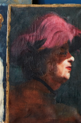
• Ladies in Hats •