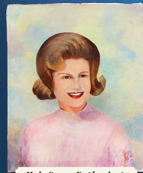
• Hair Spray Enthusiasts •